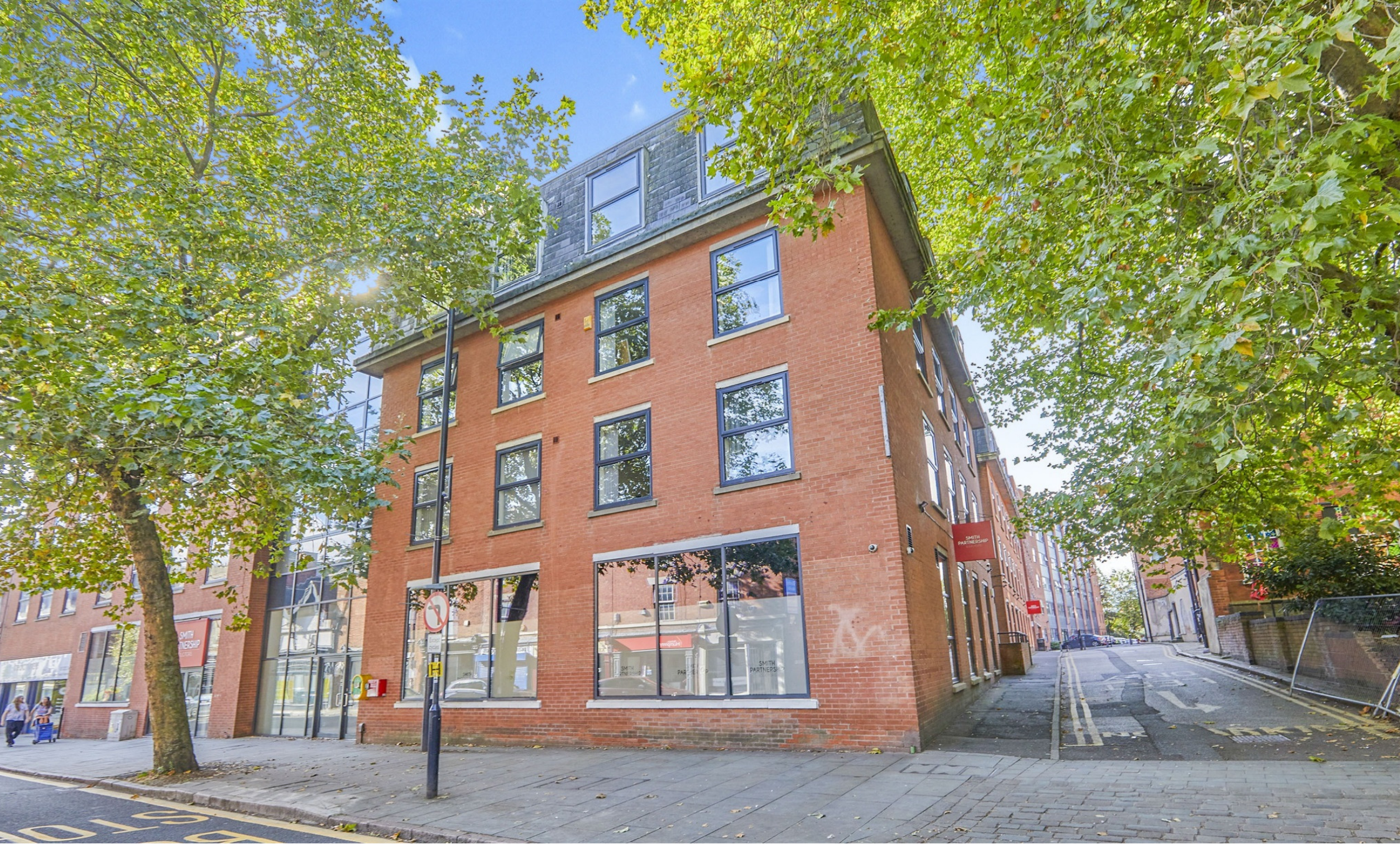
Norman House Friar Gate, Derby DE1 1NU