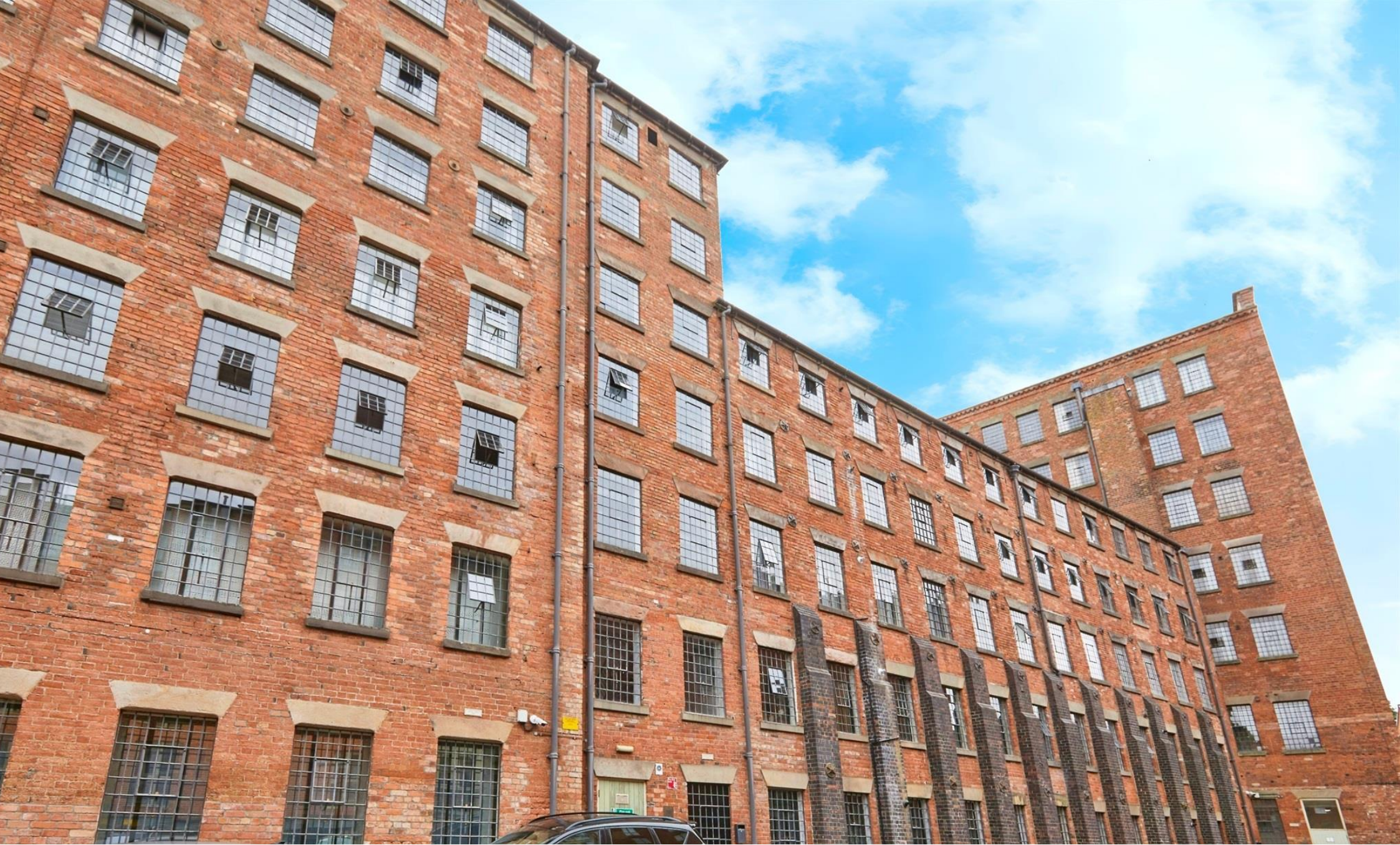
Abels Mill, Brookbridge Court, Derby DE1 3LG