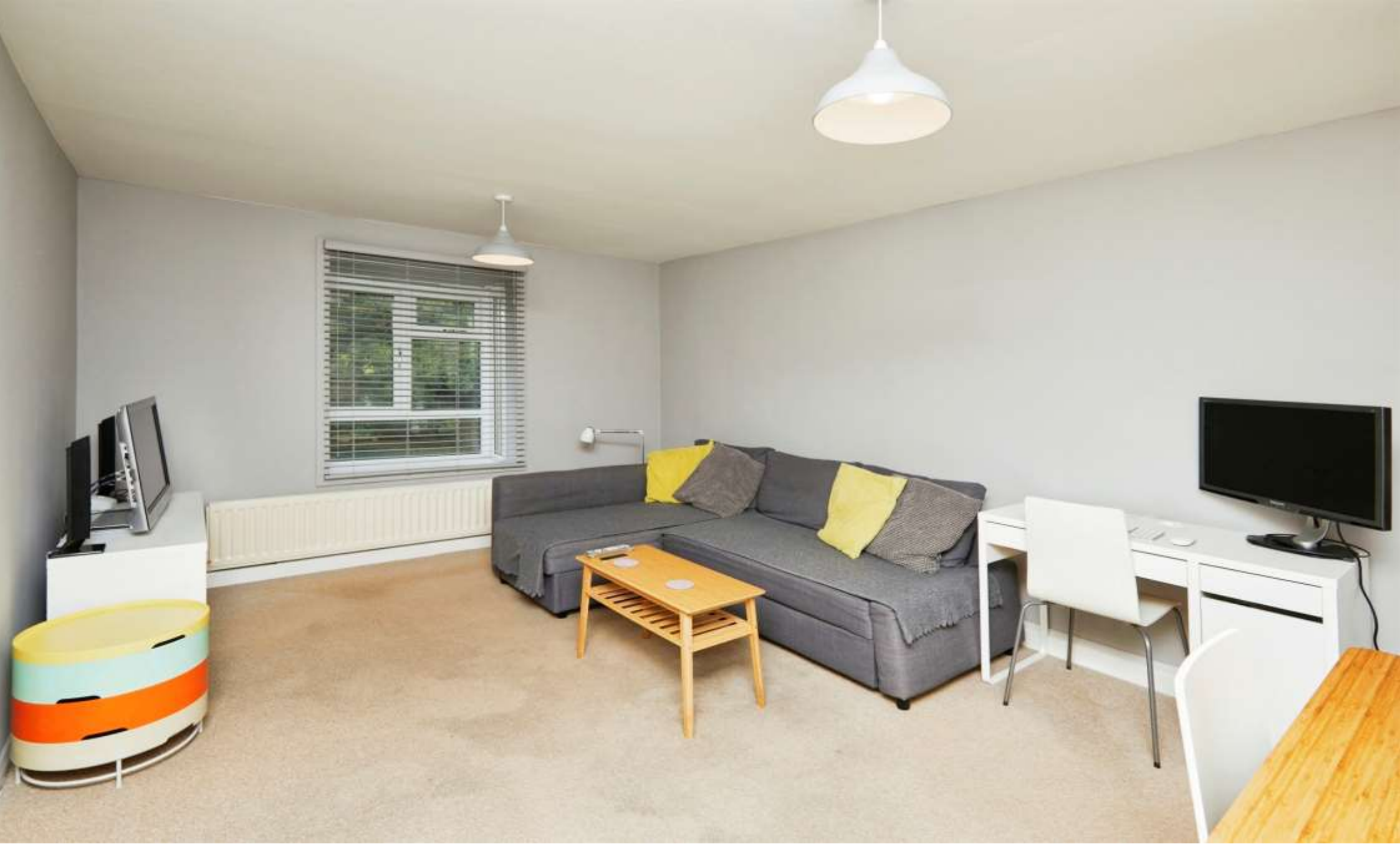
Summerbrook Court Spring Street, Derby, DE22 3RR