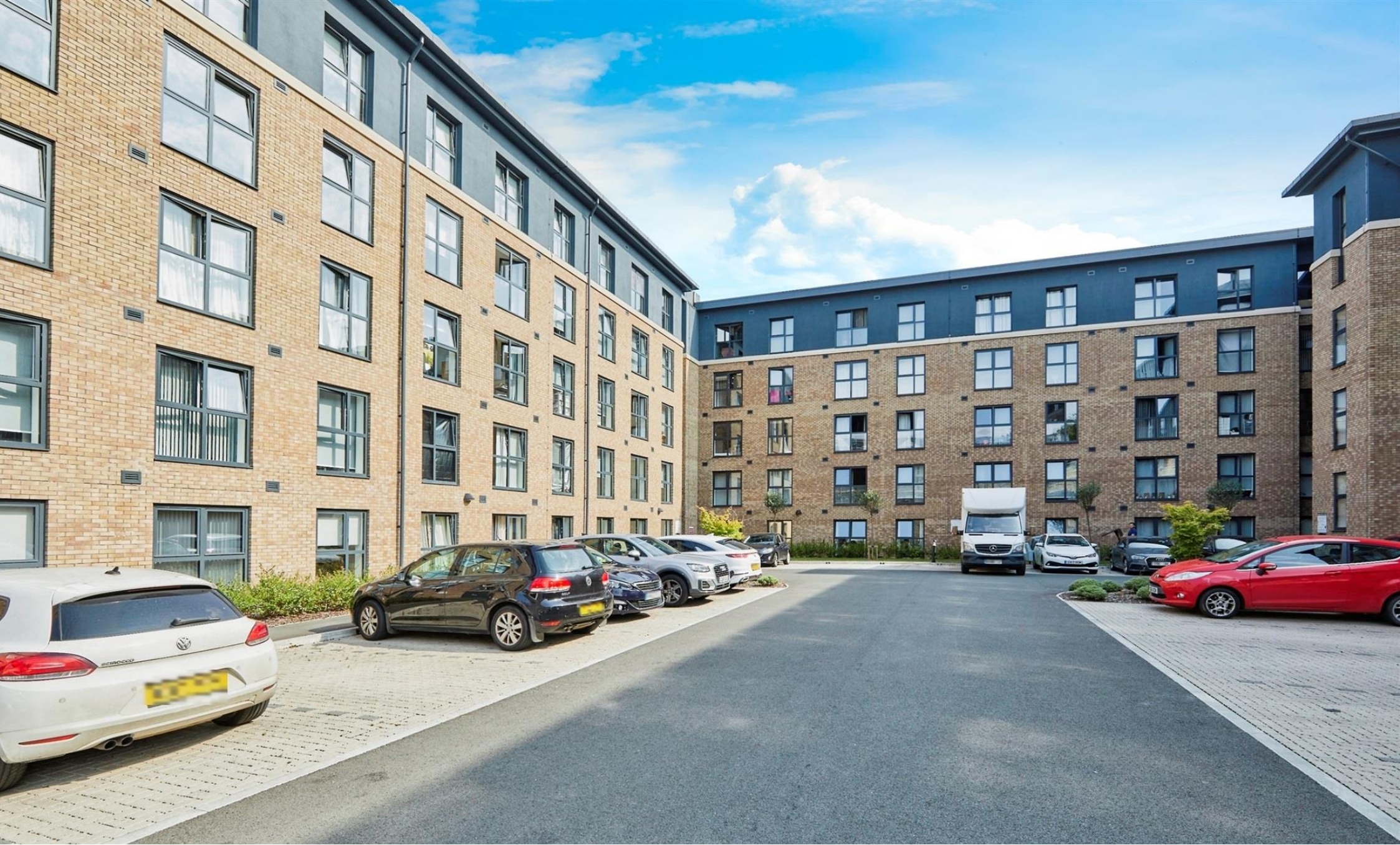
Strutt House Erasmus Drive, Derby DE1 2DY