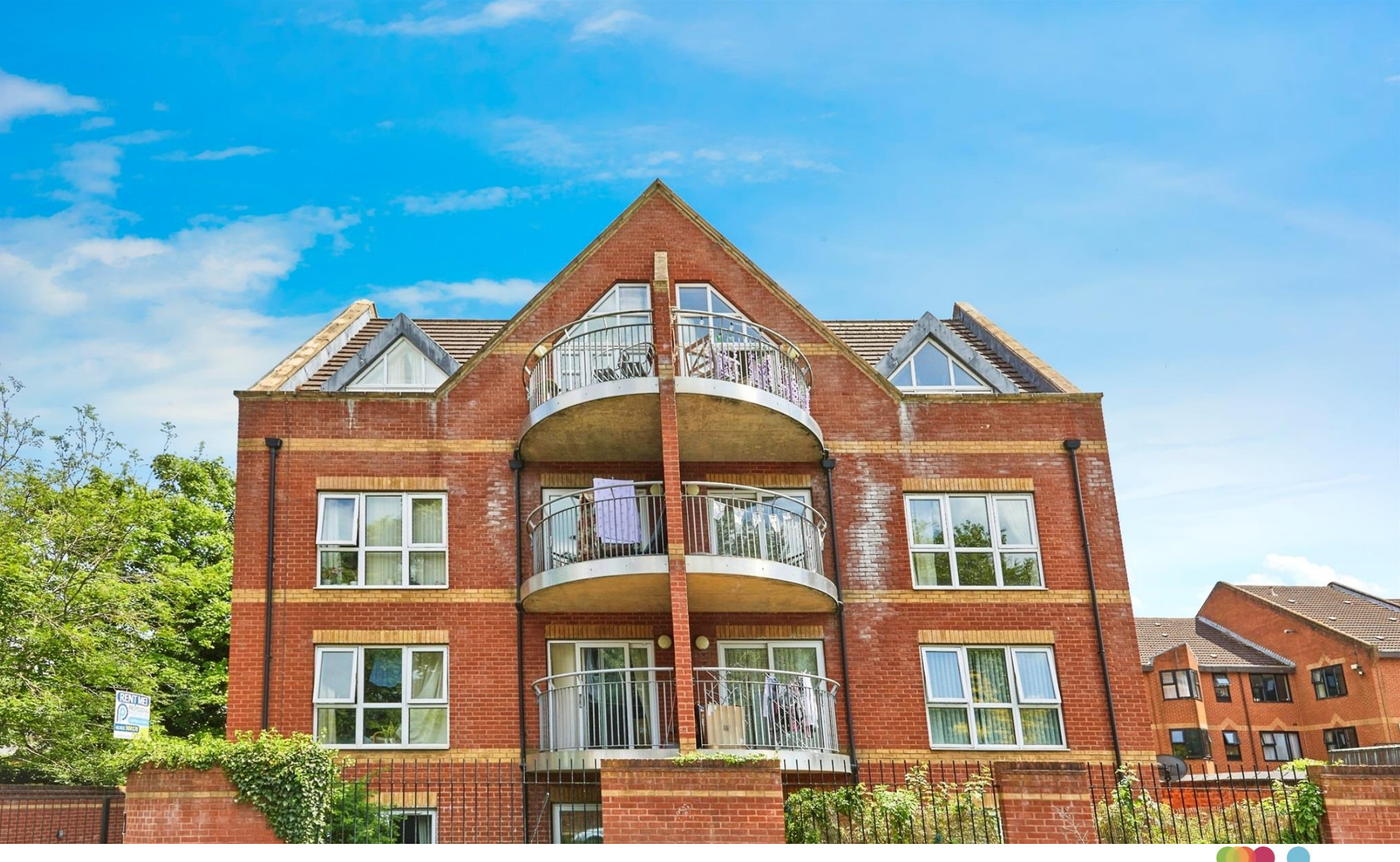
Park Gate Reginald Street, Derby DE23 8FQ