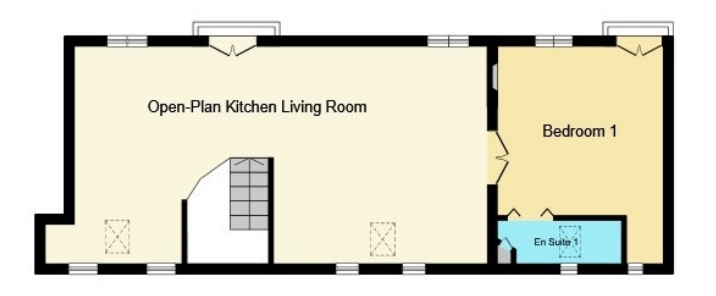
Spout Barn First Floor