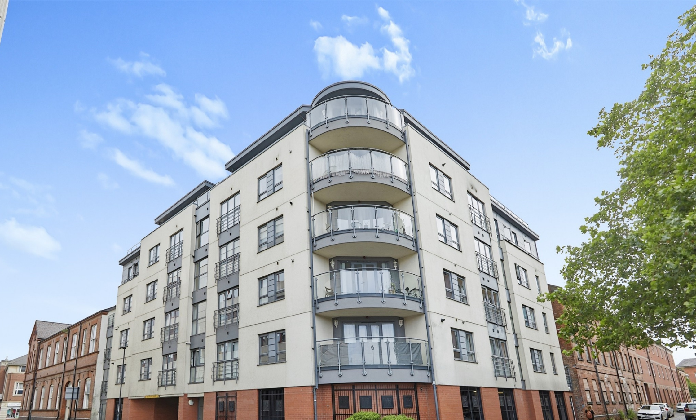
Rutland House Carrington Street, Derby DE1 2NH