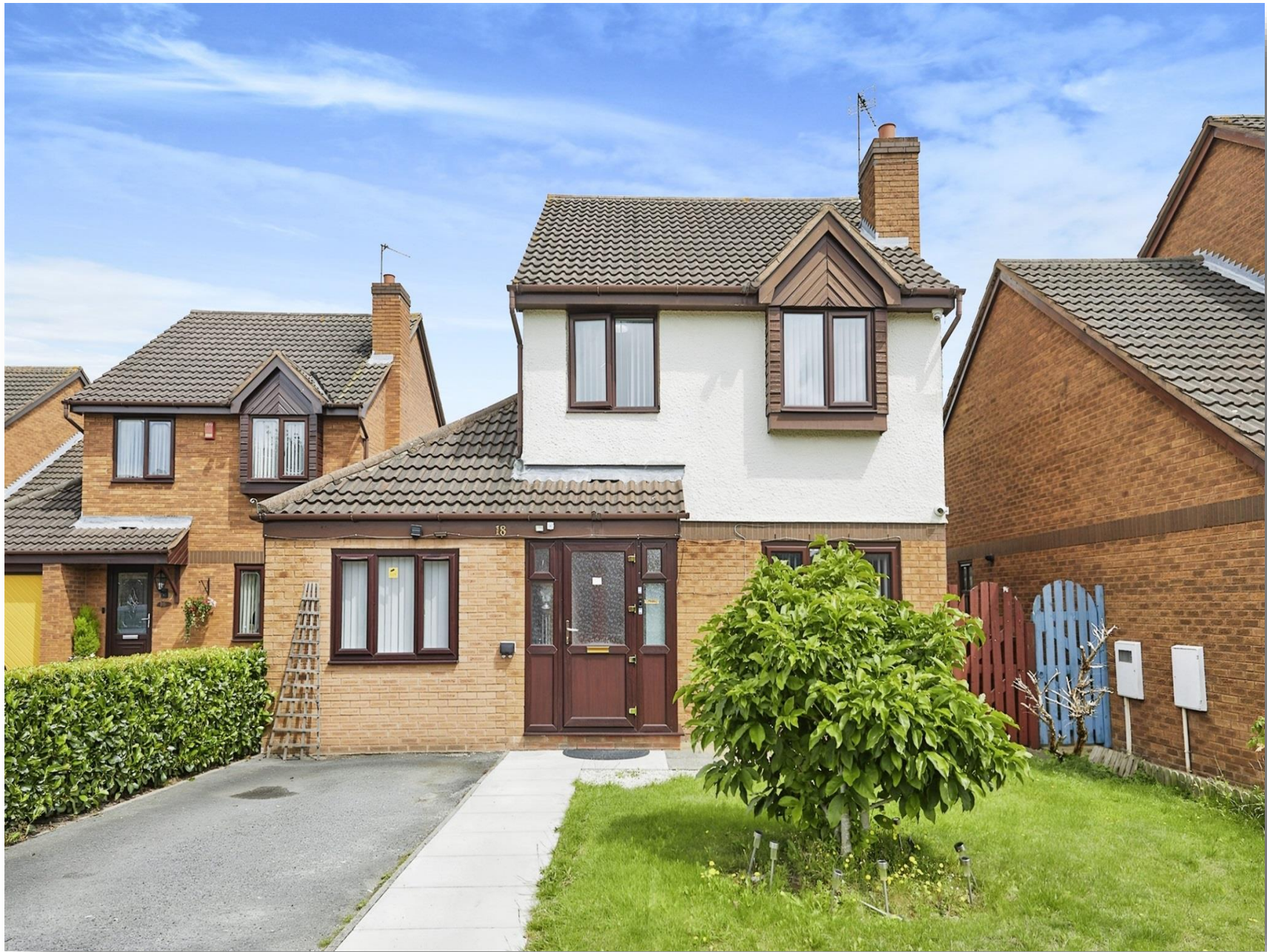
Tregony Way, Stenson Fields Derby DE24 3LG