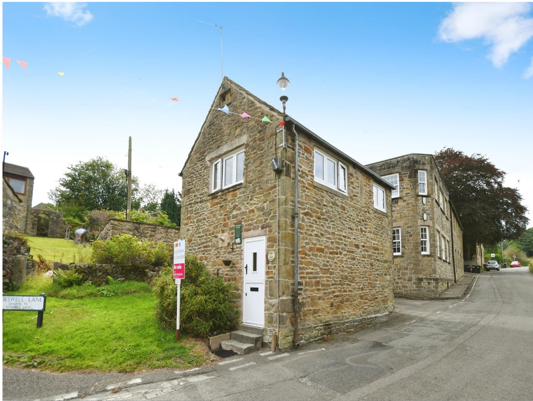
Silk Cottage Townhead, Eyam Hope Valley S32 5RE