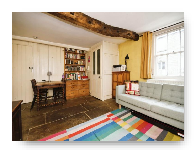
Mawstone View Main Street, Youlgreave Bakewell DE45 1UW