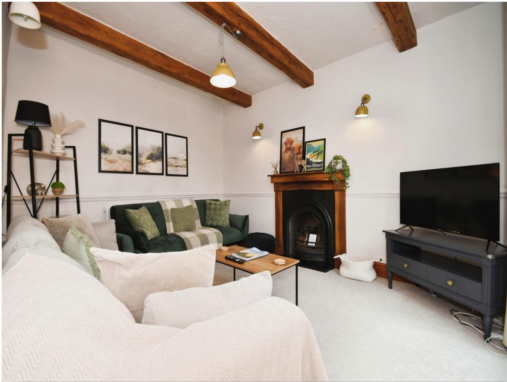
West View Main Road, Wensley Matlock DE4 2LJ