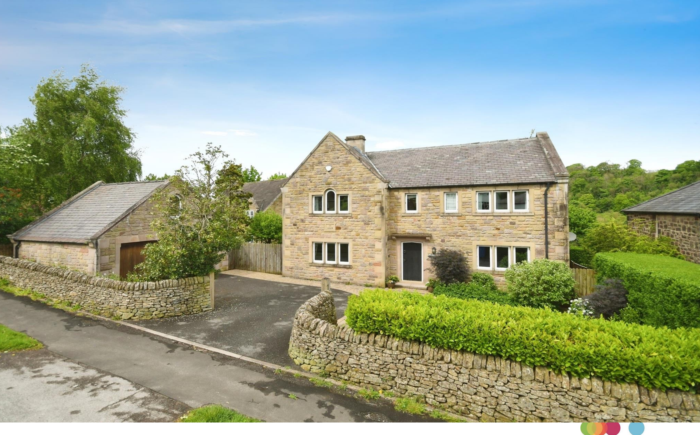
Roslyn Ashford Road, Bakewell BAKEWELL DE45 1GL