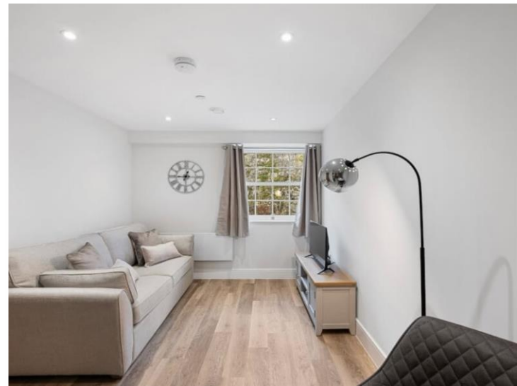
The Cavendish Penthouse Suite Rock Mill, The Dale, Stoney Middleton Hope Valley S32 4TF