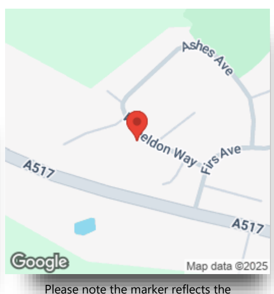
postcode not the actual property