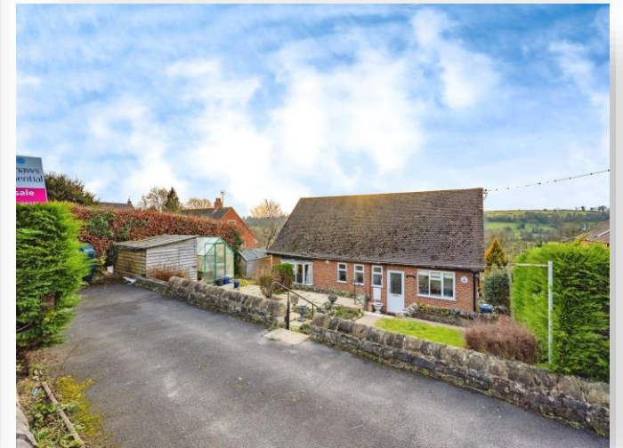
Drysdale House House, Fenny Bentley Ashbourne DE6 1LA