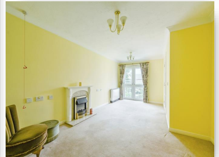
Chatsworth Court Park View, Ashbourne DE6 1PF