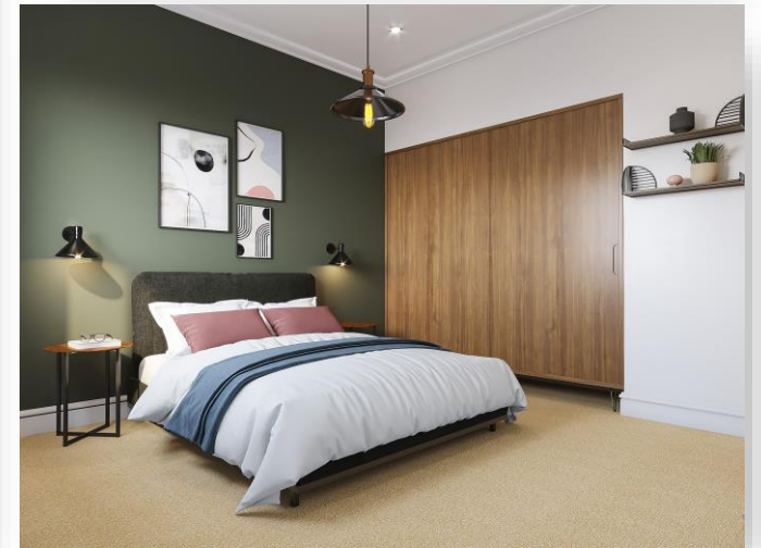
The Bowling Green King Edward Street, Ashbourne DE6 1BW