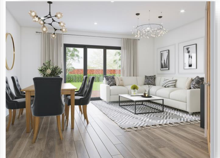
The Bowling Green King Edward Street, Ashbourne DE6 1BW