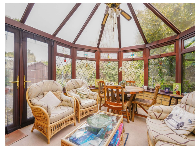
Bourne House, Burford Road ,Brize Norton, Carterton, OX18 3NN