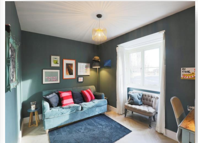
Summers Way, Moreton-In-Marsh GL56 0GA