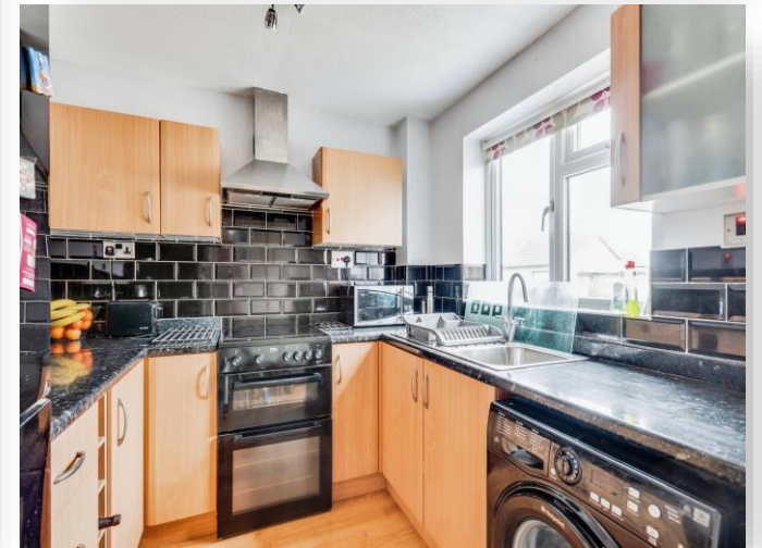
Thorney Leys, WITNEY OX28 5PJ