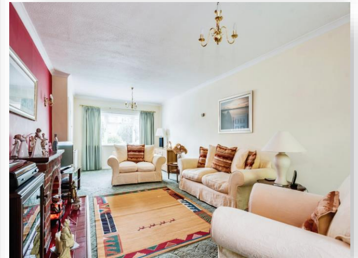
Pococks Close, Bampton OX18 2JY