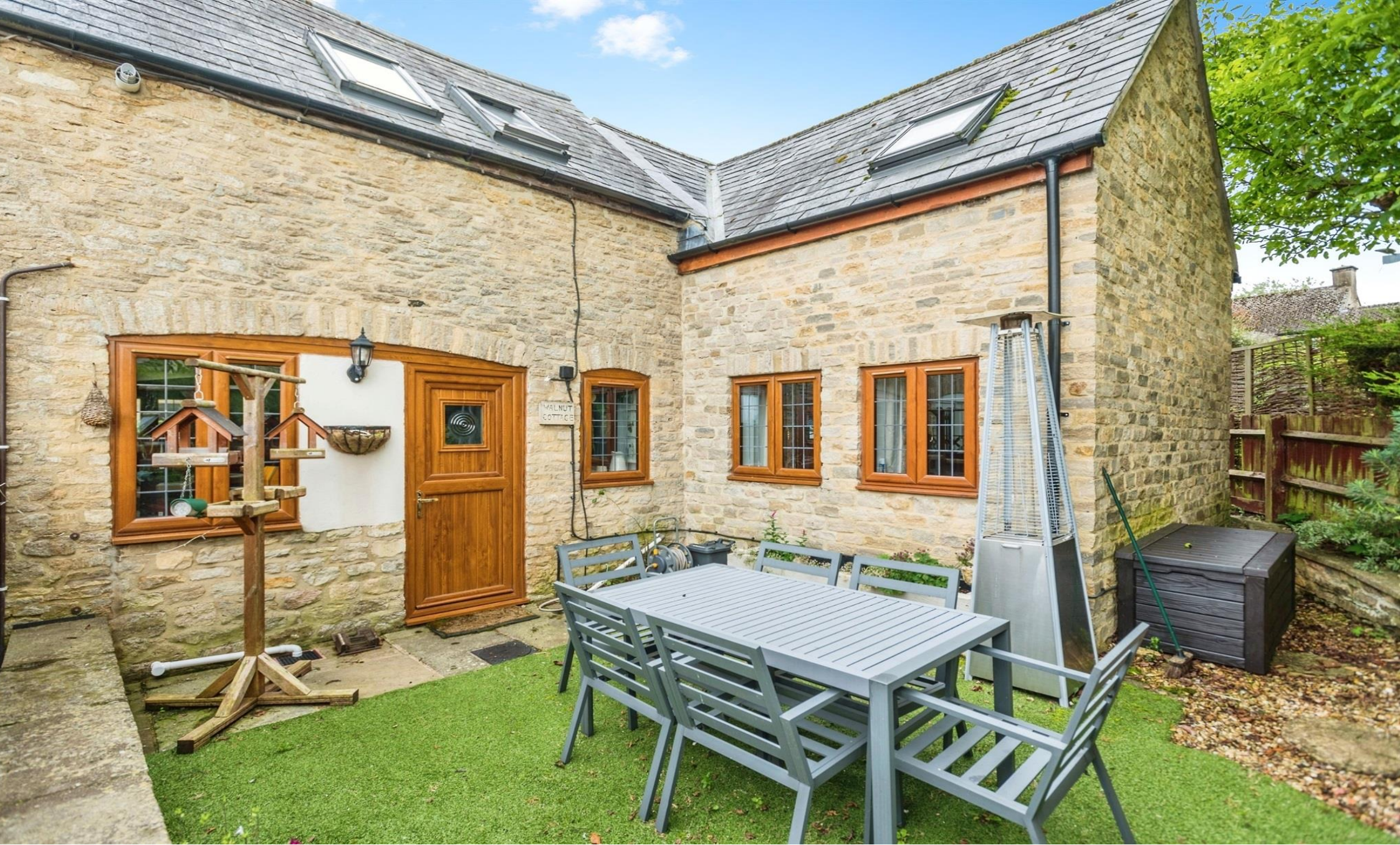
Walnut Cottage Church Road, North Leigh Witney OX29 6TX