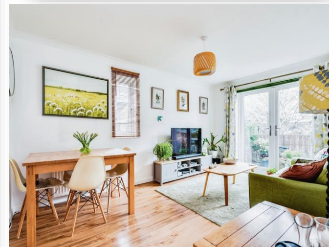
Thorney Leys, Witney OX28 5NP