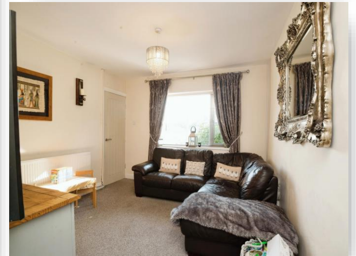
Whitesands Road, Llanishen Cardiff CF14 5LD