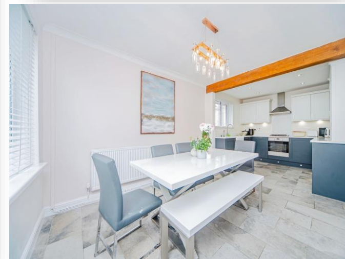
Dan-Y-Graig, Cardiff CF14 7HJ