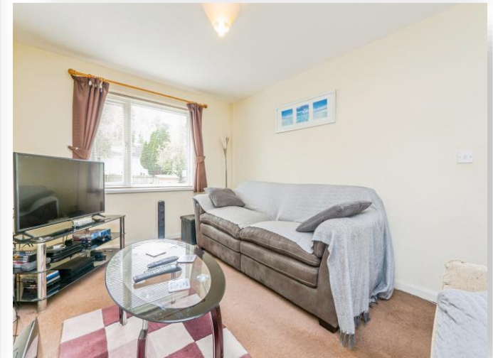
Greenmeadow Drive, Tongwynlais Cardiff CF15 7LW