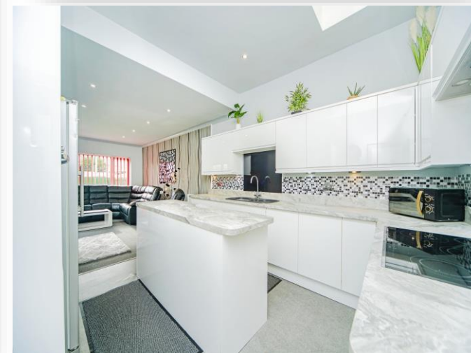
Mervyn Road, Whitchurch Cardiff CF14 1PQ