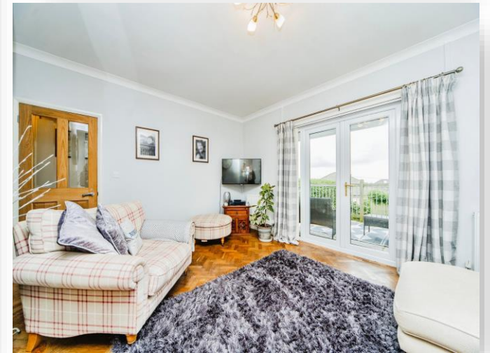
Clos-yr-Wenallt, Rhiwbina, CARDIFF CF14 6TW