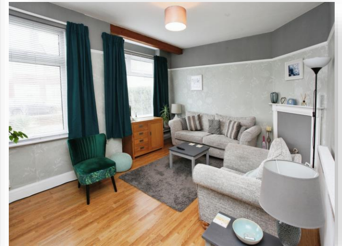
Chamberlain Road, Cardiff CF14 2LX