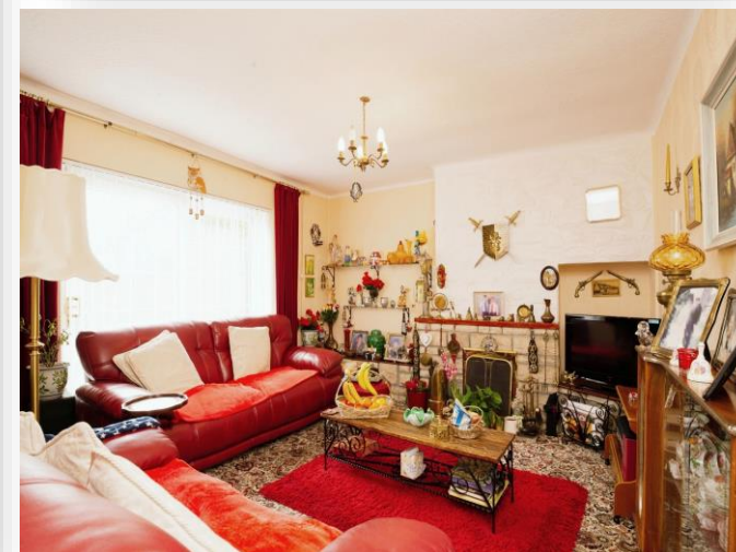
Tynewydd,Whitchurch Cardiff CF14 1NP