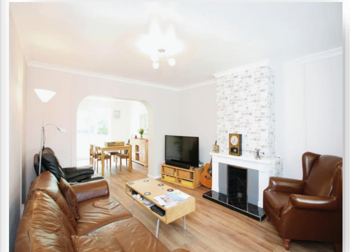
Heol Trecastell, CAERPHILLY CF83 1AE