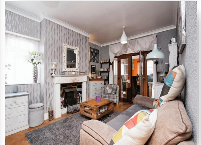
Barrington Road, Cardiff CF14 1PY