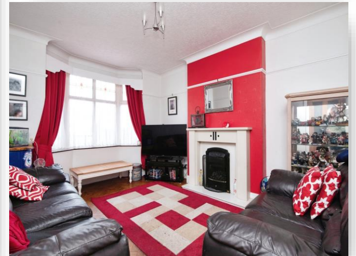
Barrington Road, Cardiff CF14 1PY