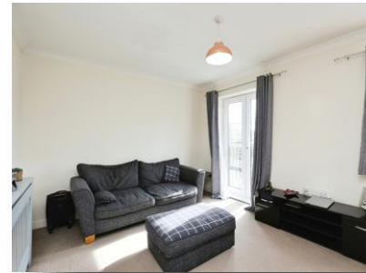
Entrance Hall Reception Room

17' 10" longest x 11' 2" ( 5.44m longest x 3.40m )