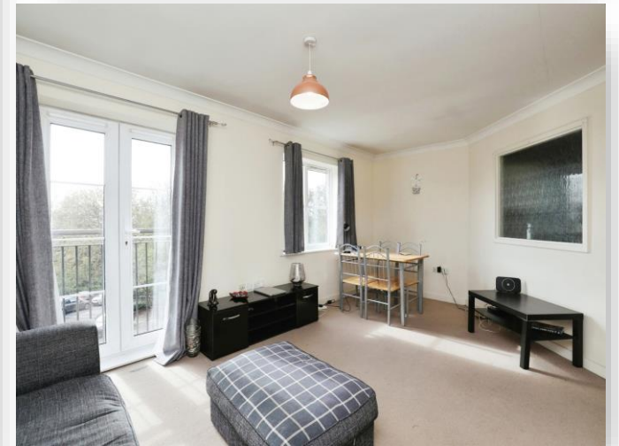
Heol Llinos, Cardiff CF14 9JF