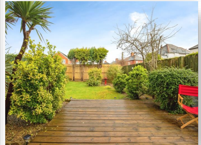
Nant Y Fedw, Cardiff CF14 1SD