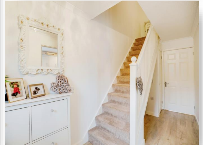
Heol Llinos, Thornhill Cardiff CF14 9JF