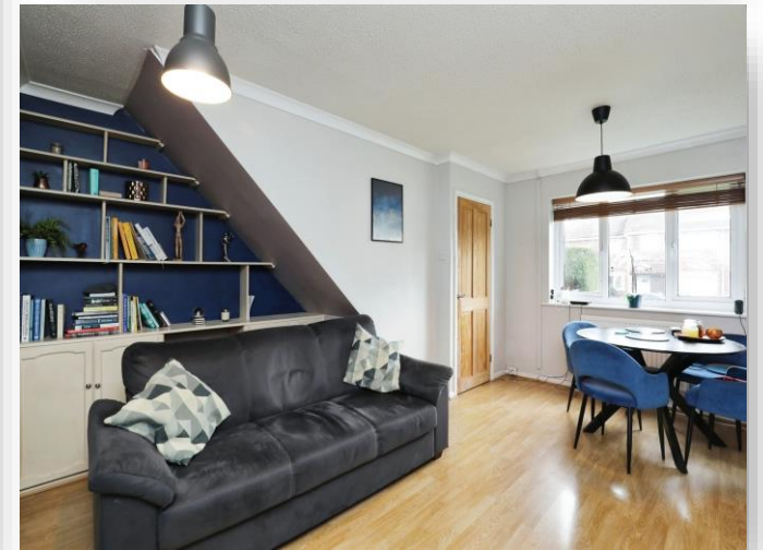
Alwen Drive, Thornhill Cardiff CF14 9HD