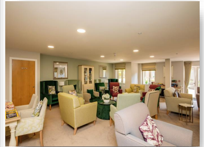
Llys Isan Ilex Close, Llanishen Cardiff CF14 5DZ