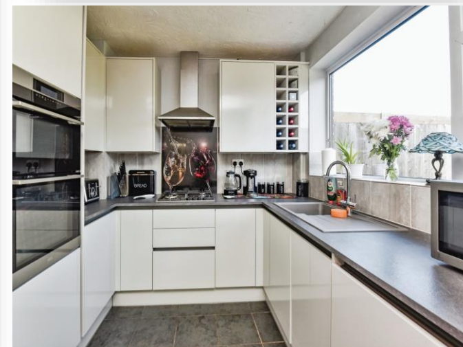
Westcroft Street, Trowbridge BA14 8NA