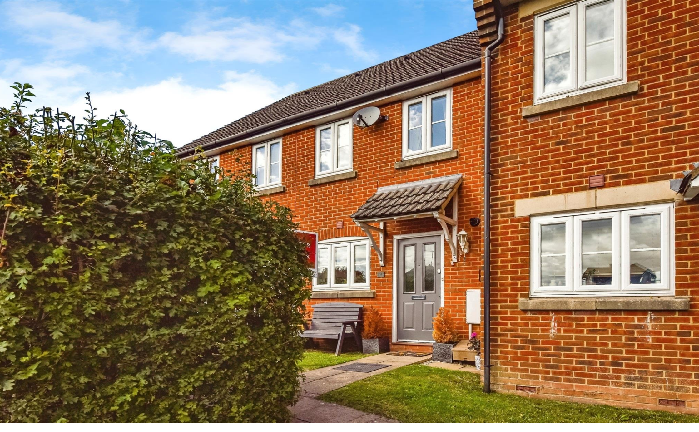
Chestnut Tree Gardens, Warminster BA12 8FD