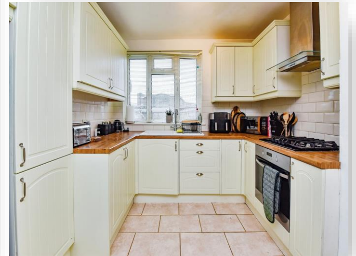
Springfield Road, Westbury BA13 3QQ