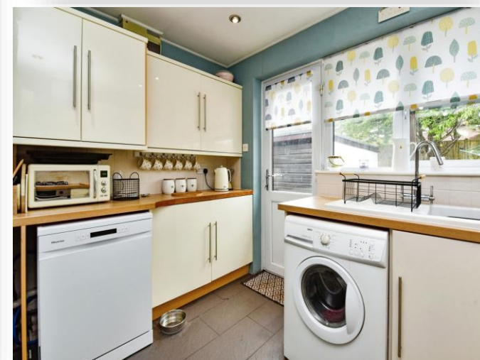
Ruskin Drive, Warminster BA12 8SA