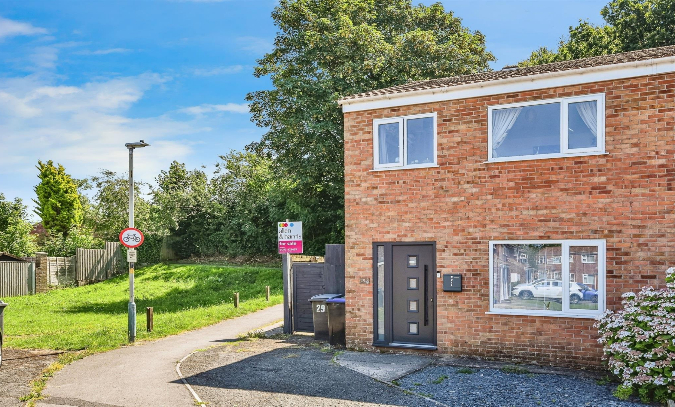
Matravers Close, Westbury BA13 3NS