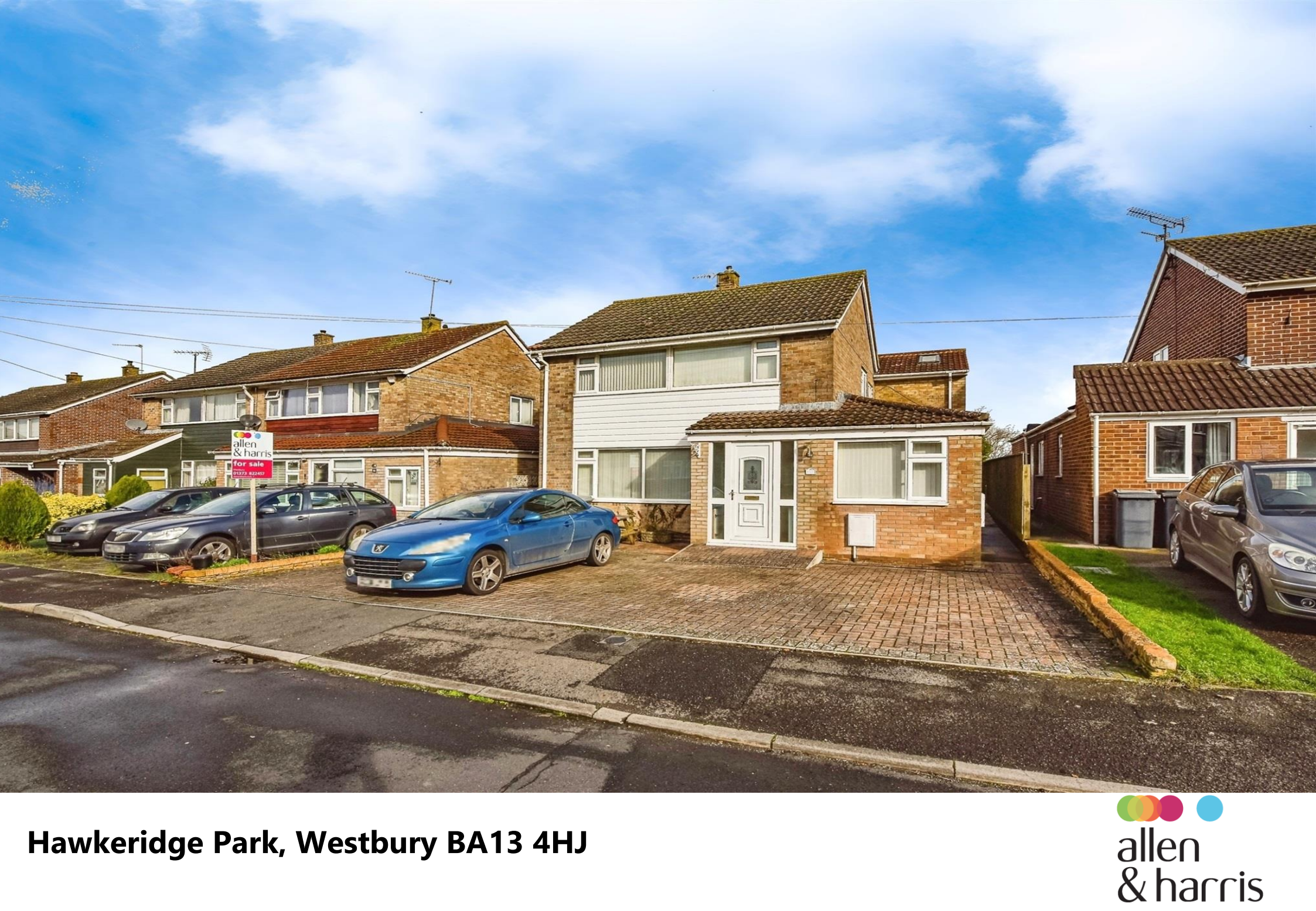
Hawkeridge Park, Westbury BA13 4HJ