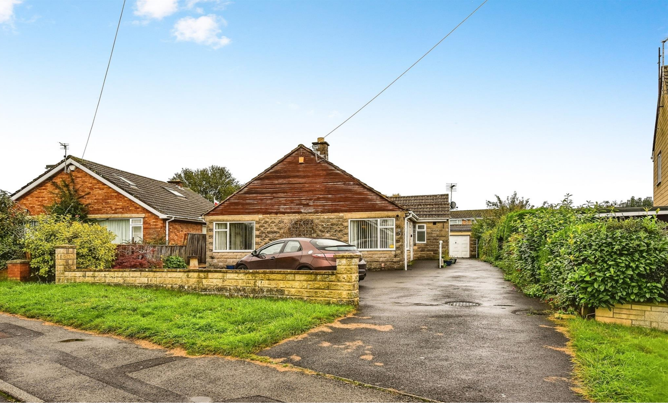
Willow Grove, Trowbridge BA14 0HA