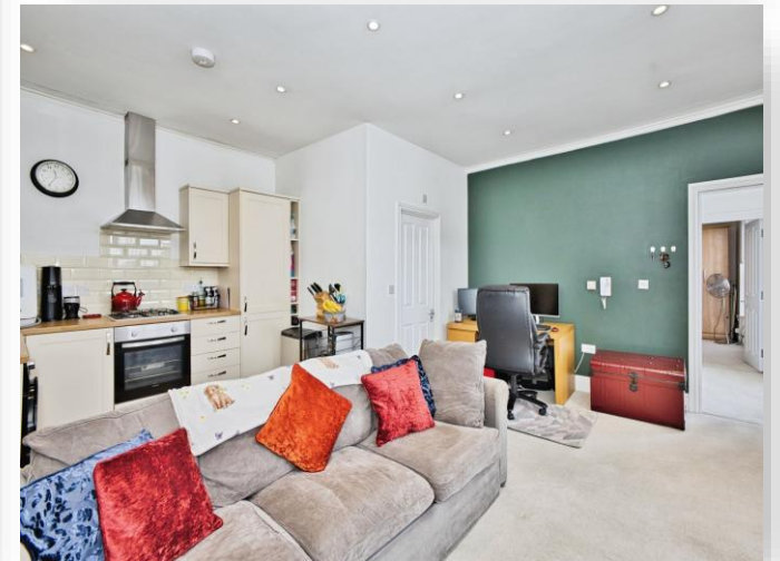
Flat 4, 65 High Street, Shepton Mallet, BA4 5AQ