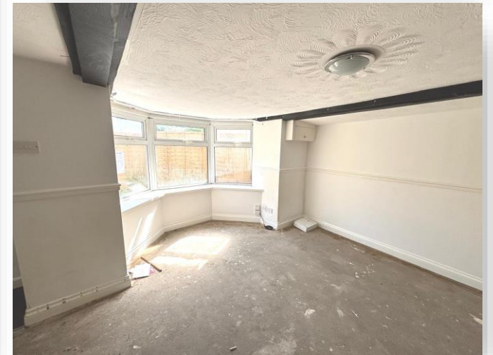
1 Twinways, Cannards Grave, Shepton Mallet, BA4 4LY