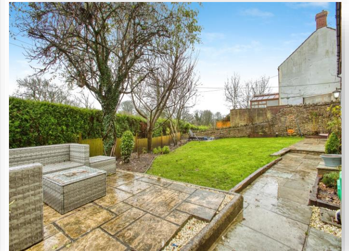
13 Back Lane, Downside, Shepton Mallet, BA4 4JR