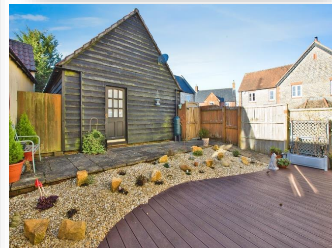
44 Little Brooks Lane, SHEPTON MALLET, BA4 4BW